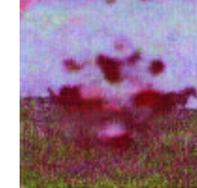
P_{0.5}(w) \rightarrow Q_8(w, f)