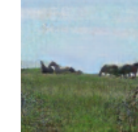
Q_{12}(w, f) \rightarrow P_{0.5}(w, f)